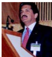
Mr Anand Mahindra, Vice-Chairman, Mahindra and Mahindra, India