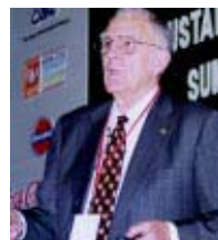
Nobel Laureate Prof. F Sherwood Rowland, Donald Bren Research Professor, University of California, Irvine