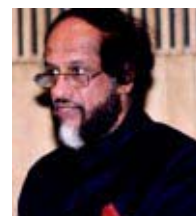
Dr R K Pachauri, Director-General, TERI