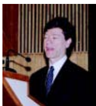
Prof. Jeffrey D Sachs, Director, The Earth Institute, Columbia University, USA