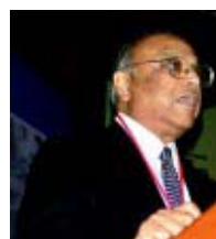
Prof. C K Prahalad, University of Michigan, USA