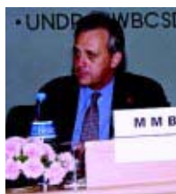
Mr Mark Malloch Brown, Administrator, UNDP, USA