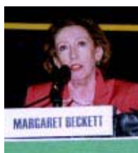
Ms Margaret Beckett, Secretary of State for Environment, Food and Rural Affairs, UK