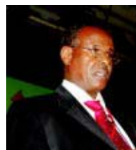
Mr Adugna Jebessa, State Minister of Water Resources, Ethiopia