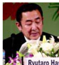
Late Dr Ryutaro Hashimoto, former Prime Minister of Japan