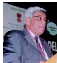
Mr Deepak Parekh, Chairman, Housing Development Finance Corporation Ltd, India