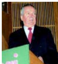
Prof. Klaus Topfer, Executive Director, UNEP, Nairobi