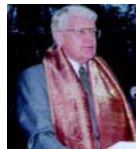
Dr Olafur Ragnar Grimsson, President of the Republic of Iceland