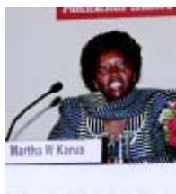
Ms Martha Wangari Karua, Hon'ble Minister for Water Resources Management and Development, Kenya