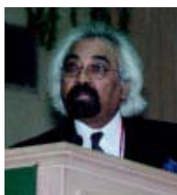
Dr Sam Pitroda, Chairman and CEO, Worldtel, UK