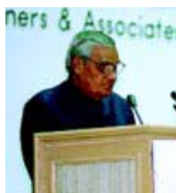
Mr Atal Behari Vajpayee Hon'ble Prime Minister of India