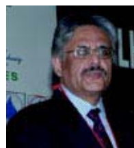
Mr Y C Deveshwar, Chairman, ITC Ltd, India