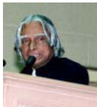
Dr A P J Abdul Kalam, Hon'ble President of India