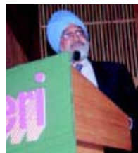
Dr Montek Singh Ahluwalia, Dy Chairman, Planning Commission, India