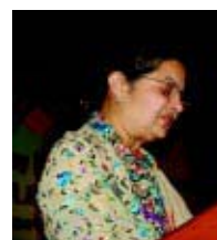
Ms Rajashree Birla, Chairperson, Aditya Birla Group, India