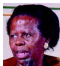
Ms Rejoice Mabudafhasi, Hon'ble Deputy Minister for Environmental Affairs, South Africa