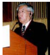
Dr Shoichiro Toyoda, Honorary Chairman, Toyota Motor Corporation, Japan