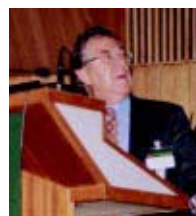
Nobel Laureate Prof. Paul Crutzen, Dept of Atmospheric Chemistry, Mainz, Germany