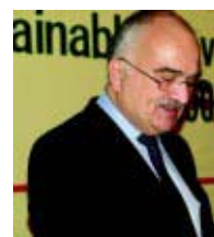
HRH Prince El Hassan bin Talal, Prince of Jordan