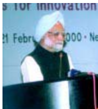
Dr Manmohan Singh