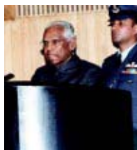
Late Dr K R Narayanan, Hon'ble President of India