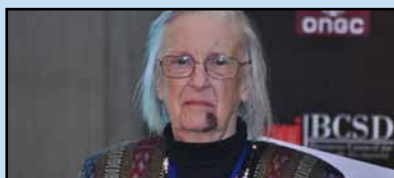
Nobel Laureate Dr Elinor Ostrom