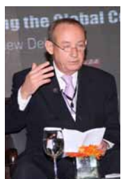
Mr Yvo de Boer