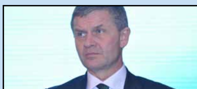
HE Mr Erik Solheim