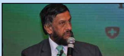
Dr R K Pachauri