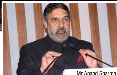
Mr Anand Sharma

Dr Sam Pitroda emphasized that developmental modules based