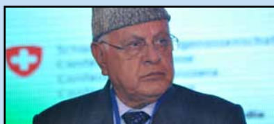
Dr Farooq Abdullah