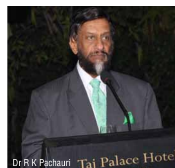
Dr R K Pachauri