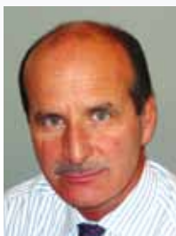
Mr Jose Maria Figueres Olsen, Former President, Costa Rica