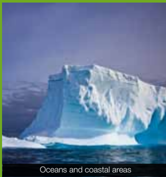
Oceans and coastal areas