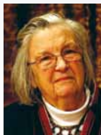
Nobel Laureate Dr Elinor Ostrom, USA