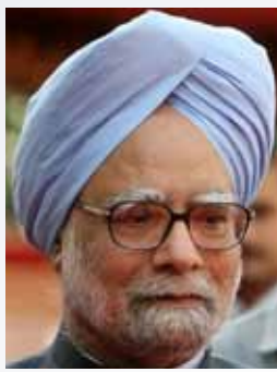
Dr Manmohan Singh Prime Minister, India