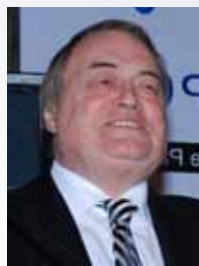
The Rt. Hon. Lord John L. Prescott, House of Lords, Government, UK