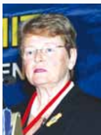
Dr Gro Harlem Brundtland, Former Prime Minister, Norway