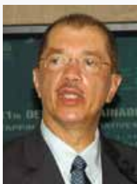
Mr James Alix Michel, President, Seychelles