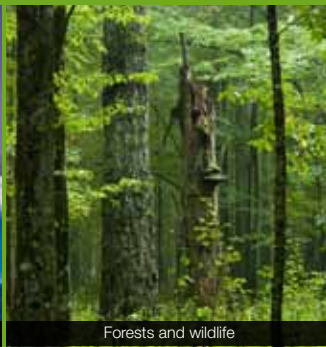
Forests and wildlife