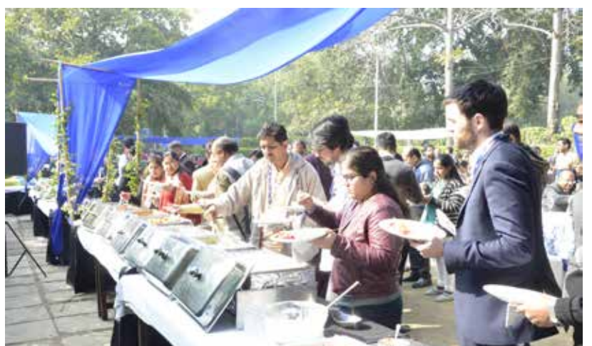
Lunch Hosted by Country Partners