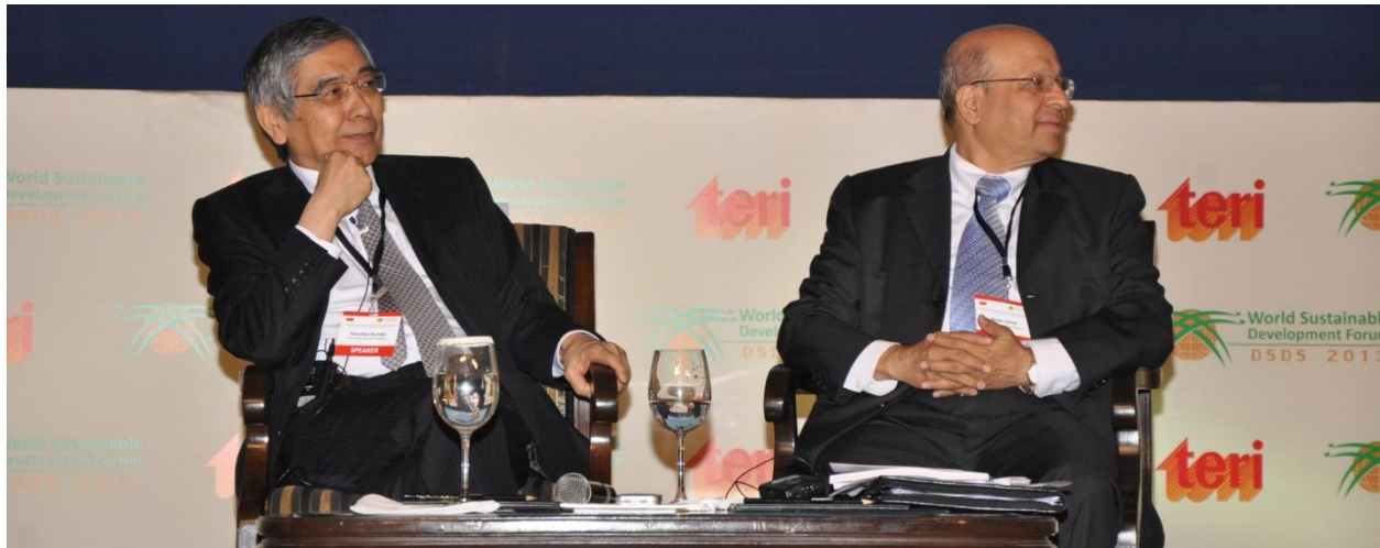
L-R: Mr Haruhiko Kuroda and Dr Bindu N. Lohani