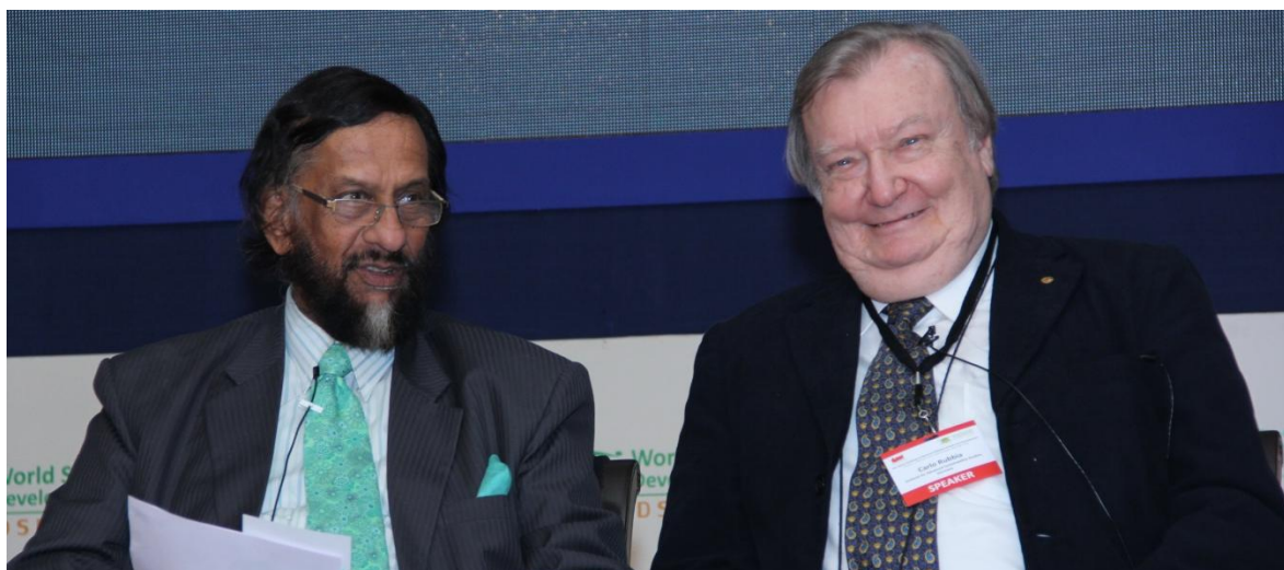
L-R: Dr R K Pachauri and Prof. Carlo Rubbia

Dr R K Pachauri , Director General, TERI