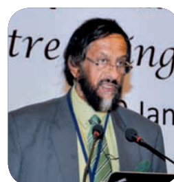
Dr R K Pachauri