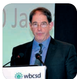
Sir Jonathon Porritt