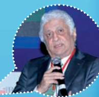
Mr Ajit Gulabchand Chairman and Managing Director, HCC Ltd

'Water is a serious concern, but it is solvable.'