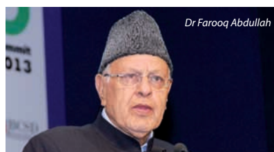
Dr Farooq Abdullah

Dr R K Pachauri welcomed the guests while emphasizing on the co-benefits that sustainability, especially accounting of water