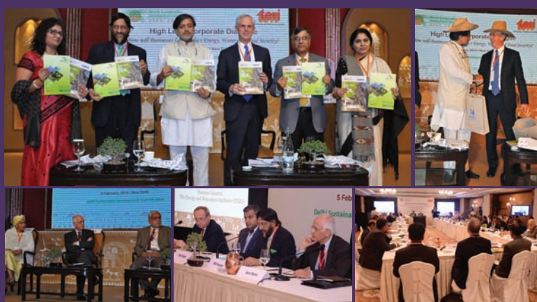
Glimpses of the High Level Corporate Dialogue 2014

Started in 2004, the High Level Corporate Dialogue has become an integral part of DSDS, bringing together eminent international and Indian CEOs to discuss the challenges businesses face in the context of sustainable development. Till date, the event has attracted over 1,500 CEOs, senior government officials, and thought leaders from across the globe. The 2014 Corporate Dialogue discussions centred on the theme 'How will Indian Businesses lead India's Energy, Water, and Food Security?' The next edition of the Corporate Dialogue, to be held on February 4, 2015, will provide business perspectives towards defining the SDGs.