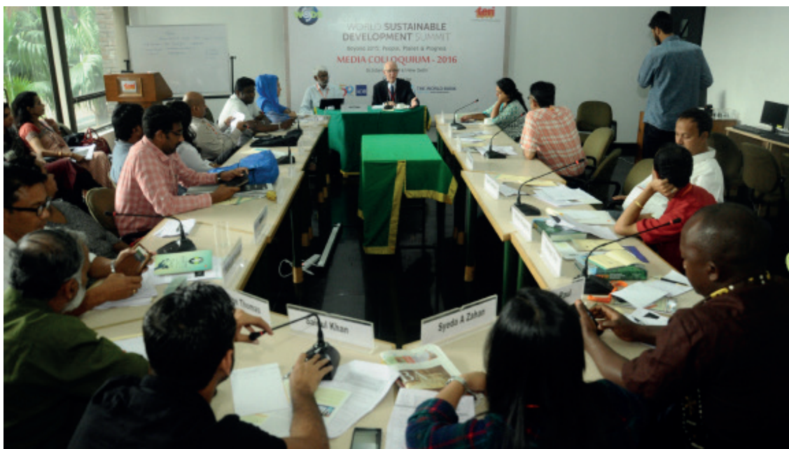
Interactive session in progress at the Media Colloquium 2016

There were seven sessions held in the seminar format exclusively for the Media Colloquium. Five were on topics relating to sustainable development and two on the craft of journalism