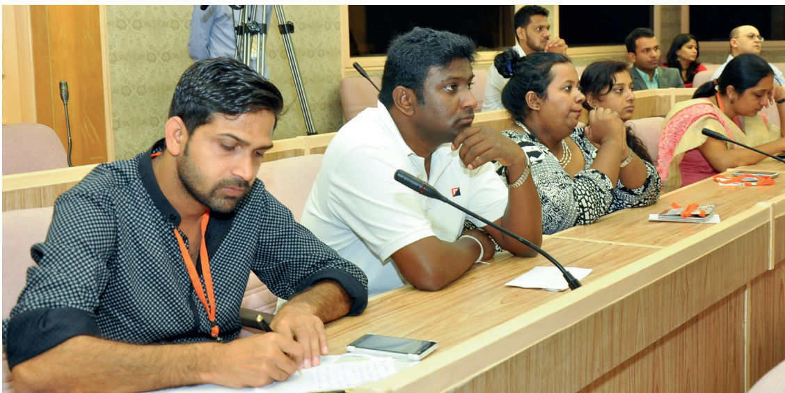
Media Colloquium participants attending WSDS sessions